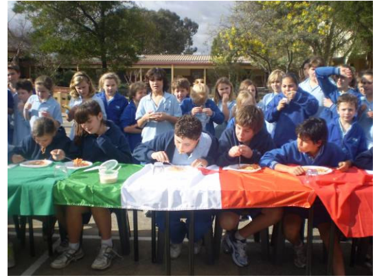
(Italian Week 2009 – 27 th /31 st July – Spaghetti Eating Competition Final)

Familiarizations with the sounds, words, phrases and simple sentences of the language occurs through the use of greetings, introductions, songs, role-plays and by performing basic routines. Patterns are generally repetitive to foster 'strategies for memorisation and comprehension'. The meaning of the language is made clear by: gestures, dramatisation, singing, dancing, activities, conversing and viewing. Students begin to develop all language skills, including writing, using models and support provided by the teacher.